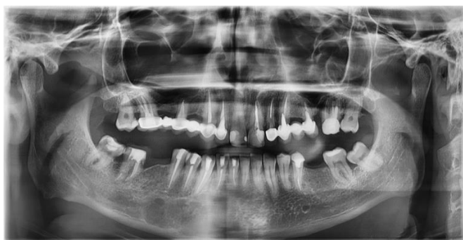
Fig. 3 The radiological image after six months shows the endodontic fillings of all the teeth adjacent to the previous lesion and the improved aspect of the bone in the lower right mandible.

patient constantly took VitD 2000UI a day, for six months. The radiograph taken after this period of time showed a clear resolution of the bone lesion, with the trabecular and compact alveolar bone being close to a normal appearance ( Fig 3). The patient received in the end a prosthetic restorations for the edentulous spaces consisting in a ceramic fused to metal bridge in the fourth quadrant and a dental implant in the third quadrant.