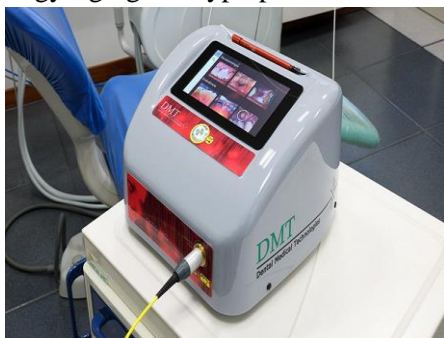
Image 1. Nd: YAG laser, its use is safe in oral pathology - gingival hyperplasia

Nd: YAG laser ( neodymium-yag ) can be used in gingival hyperplasia therapy to treat and reduce excessive growth of gingival tissue. This procedure has some benefits and potential side effects, which should be considered: