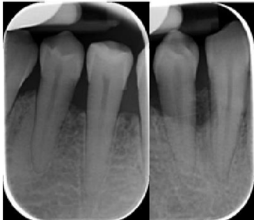
Figure 5. Rx retroalveolar mandibular radiographs