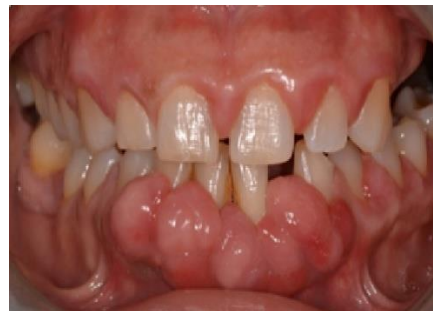
Figure 3. In the initial case, the lateral norm page

Figure 2. In the initial case, the frontal norm