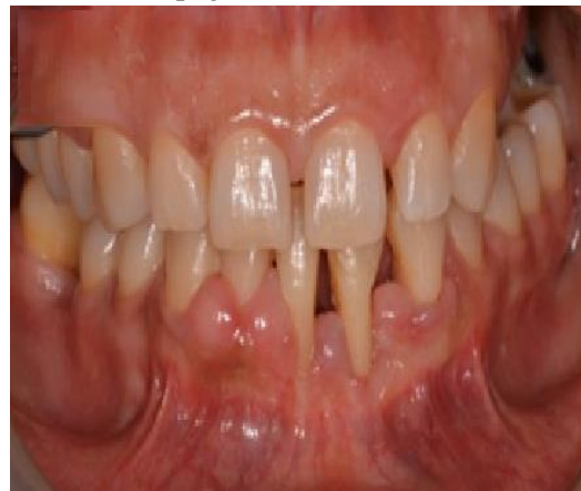
Figure 8. In the final case after laser treatment, the lateral norm page