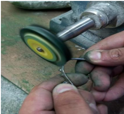
Fig. 7 Polishing the metal skeleton