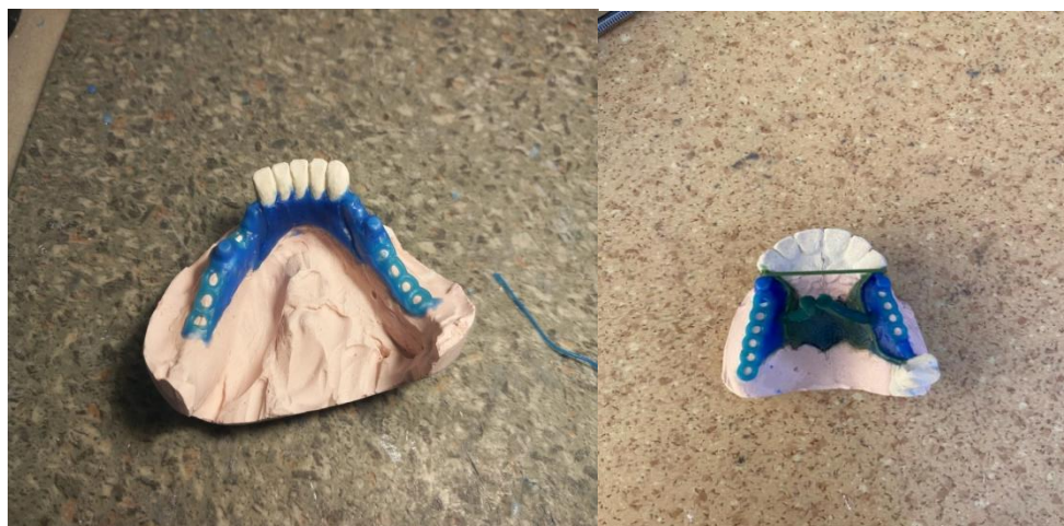
Fig 1 Model of the lower skeleton ; Model of the upper skeleton

- the mock-up is carefully finished and it is checked whether the requirements related to the design have been respected.