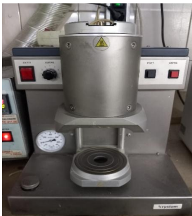
Fig 3 Tristolit molding machine