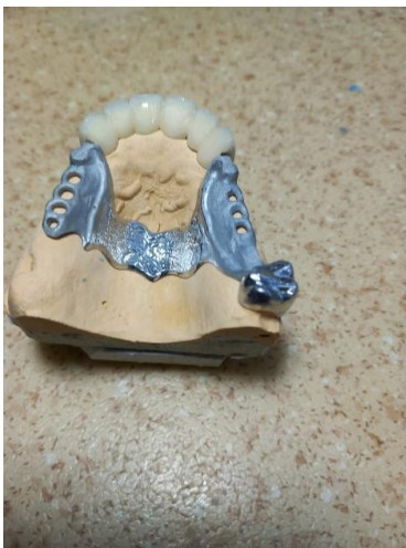
Fig. 8 The metal skeleton polished and sandblasted

Due to this compositional element, this alloy has been used extensively in dentistry and medicine for implants.