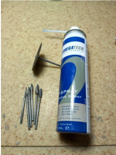
Fig. 6 Tools used to adapt and process the metal