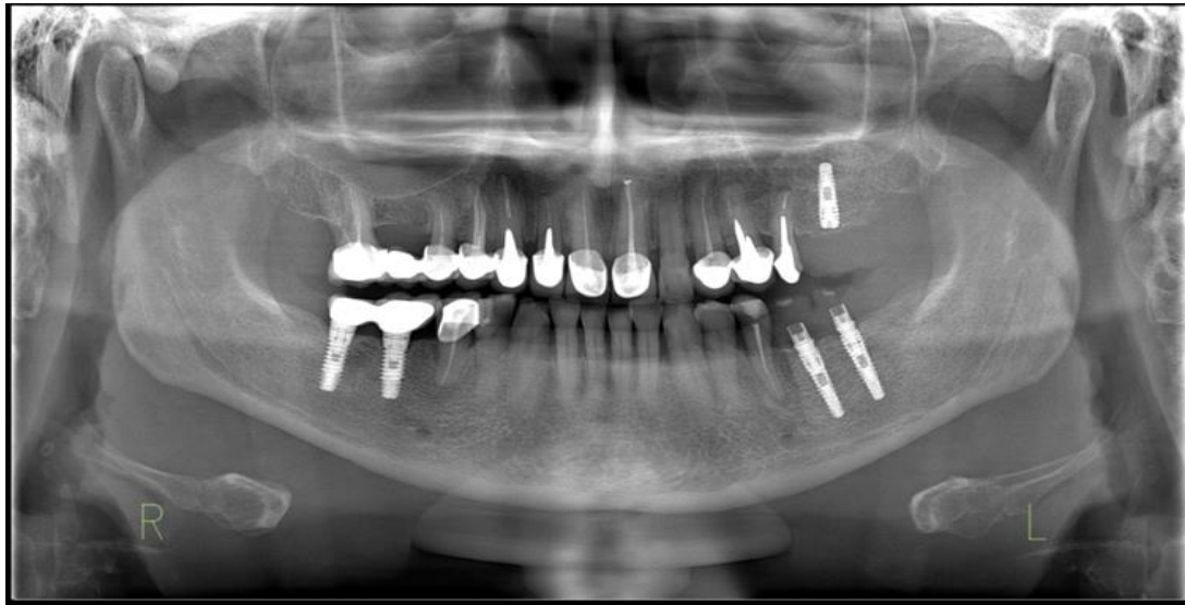
Fig.8. Radiological appearance on the same day post-implantation

was performed with temporary restorations.