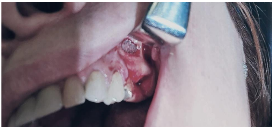
Fig.5. The sinus wall was grafted with autologous bone Apathos (OsteoBiol) by Tecnos mixed with PRF liquid (forming the sticky bone)

PRF clots were produced intra-operatively following a standard protocol: venous blood of the patients was collected in 9 mL vacutainers without clot activator or gel separator. Blood collection was performed with pre-attached, pre-fabricated sets (Vacutainer® Safety-Lok, Becton, Dickinson & C., Franklin Lakes, NJ, USA). Immediately after blood collection, the