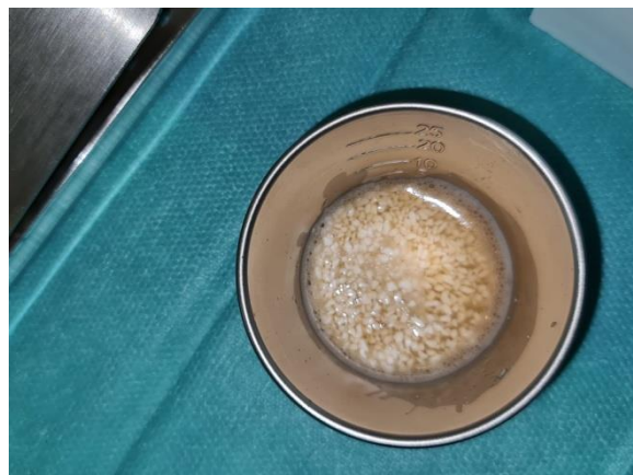
Fig.7. The bone mixed with PRF liquid (forming the sticky bone)

the ceiling of the cavity created in the sinus and the other resorbable collagen membrane (Biogide, Geistlich, Wolhusen, Switzerland) at the level of the created flap. A double layer suture was applied with horizontal mattress and single stitches (4.0 Vicryl) to seal the overlapping flaps.