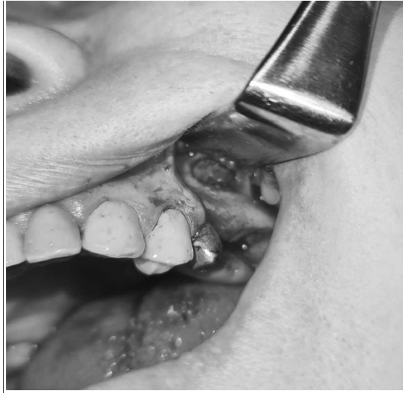
Fig. 4. A perforation was made 5 mm above the upper side of the bony window to allow the suction of the liquid inside de cyst.

bony floor by means of an antral curette (fig.5).