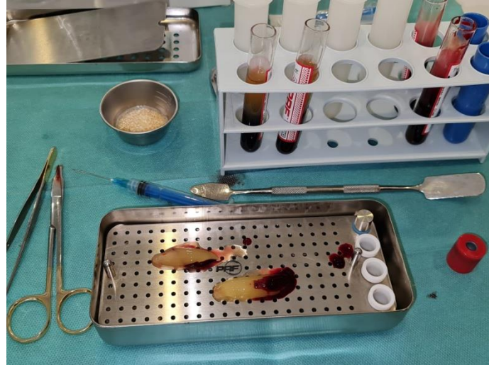
Fig. 6. Separation of the PRF fibrin product from the red blood clot

This PRF clot was applied over the bone mixed with PRF liquid (forming the sticky bone) (fig.7) having already created the cavity for inserting the implant with it inside surrounded by autologous bone Apathos (OsteoBiol) by TecnoSS. The window was closed with 2 PRF membranes. Thus, two membranes were used in this surgical technique, one made of PRF that applied to