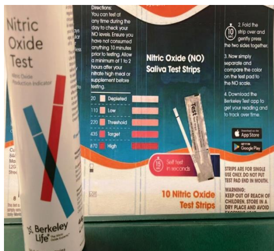
Figure. 3 Nitric Oxide Saliva Test, Berkeley, USA

The obtained result was expressed semi-quantitatively, compared with the colorimetric map available on the box, with 5 divisions corresponding to the following quantities: 20µM, 110µM, 220µM, 435µM, 870µM.