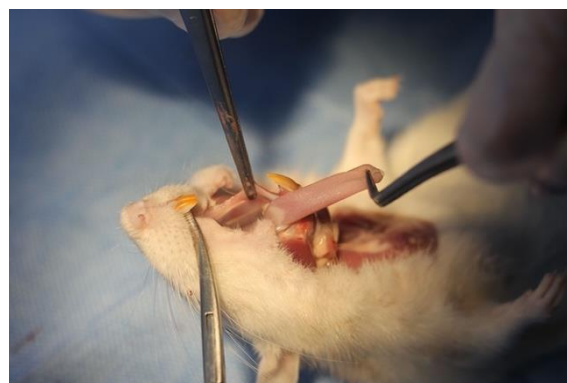
Figure 1. Harvesting a tissue sample from a sacrificed rat.

The study was performed with aged 7-12 weeks and weighing 230-300 g 34 male Wistar-Albino rats. After two weeks of acclimatization housed in metal laboratory cages under standard conditions (temperature: 22\pm 2^{\circ}\text{C} , dark/light cycles: 12/12 hours) with access to food and water ad libitum. The rats were randomly assigned to the four experimental groups. Seven rats were in the control group (Group 1) and 9 rats were in each experimental groups. In Group 2 (n=9) radiotherapy was delivered solely to the head and neck region, in Group 3 (n=9) radiotherapy was applied in the same manner and 100 mg/kg/ml propolis was systematically administered for 2 weeks, in Group 4 (n=9) radiotherapy was applied in the same manner and 200mg/kg/ml propolis was systematically administered for 2 weeks. The water-soluble propolis extracts were acquired in form of Bee'O water-soluble droplets 10%, 20 ml (SBS Scientific Bio Solutions Industry and Trade Inc., İstanbul, Turkey). The rats were administered with propolis due to determined doses by oral gavage once in every day. The rats in control group were administered with 40 mg/kg saline solution by oral gavage. At the end of study protocol on 14th day the rats were sacrificed following injections of high-dose anaesthetics and buccal tissue samples were harvested (Fig. 1).