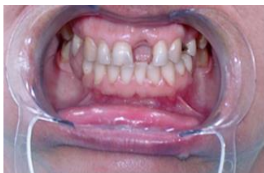
Figure 1. Intra-oral photo for initial