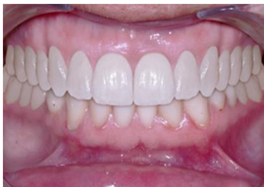
Figure 5. Intraoral view of Digital Smile Design Simulation