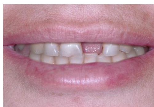
Figure 2. Image of smile line examination

After that, we transferred the first line to the smile region, to allow in this way, the positioning of the smile, and analyse the teeth and the face. For smile aesthetic it is important to have a good proportion between teeth and their position in the arch, to analyse the dental contour according to the lower lip proportions and the antero-posterior curvature of the teeth. (Fig. 3)