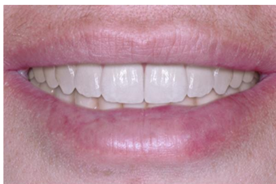
Figure 6. Mock-up of rehabilitation