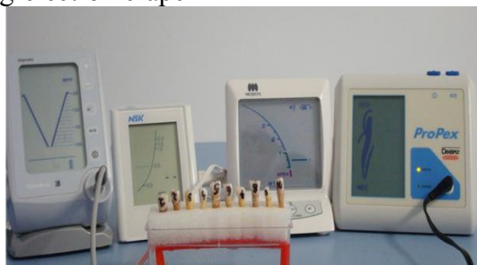
Photo 3. Element Diagnostic Unit (SybronEndo, Sybron Dental, Anaheim, CA, USA), I-Pex (NSK, Nakanishi Inc., Japan), Root ZX II (J. Morita Corp. FGM, Kyoto, Japan), ProPex (Dentslpy Maillefer Switzerland).

locators: Root ZX II (J. Morita Corp. FGM, Kyoto, Japan), Element Diagnostic Unit (SybronEndo, Sybron Dental, Anaheim, CA, USA), ProPex (Dentslpy Maillefer Switzerland), I-Pex (NSK, Nakanishi Inc., Japan). Determination was done by setting the teeth in a device that reproduces the apical tissue emerged in a 0.9% saline solution. The root canal was irrigated with 0,1 ml of the same saline solution.